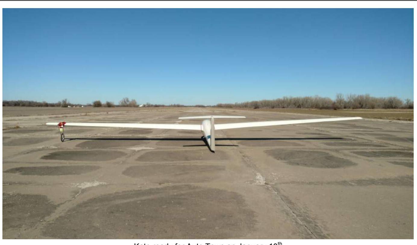
Kate ready for Auto Tows on January 10<sup>th</sup>