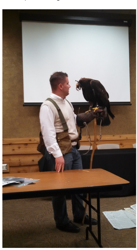
March KSA Meeting