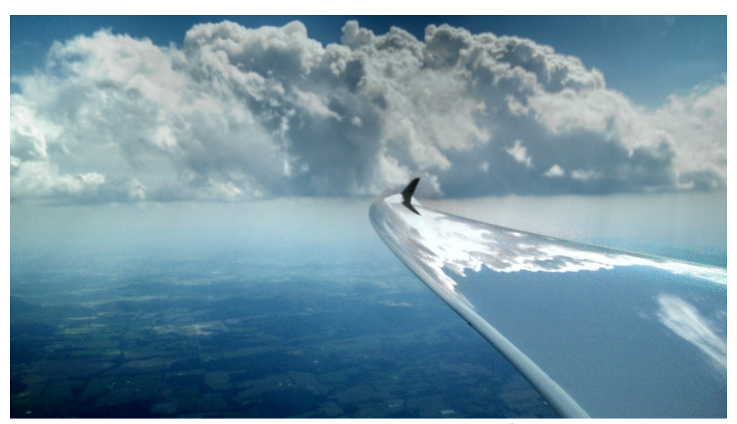
Soaring over Tennessee in the Electro March 31st