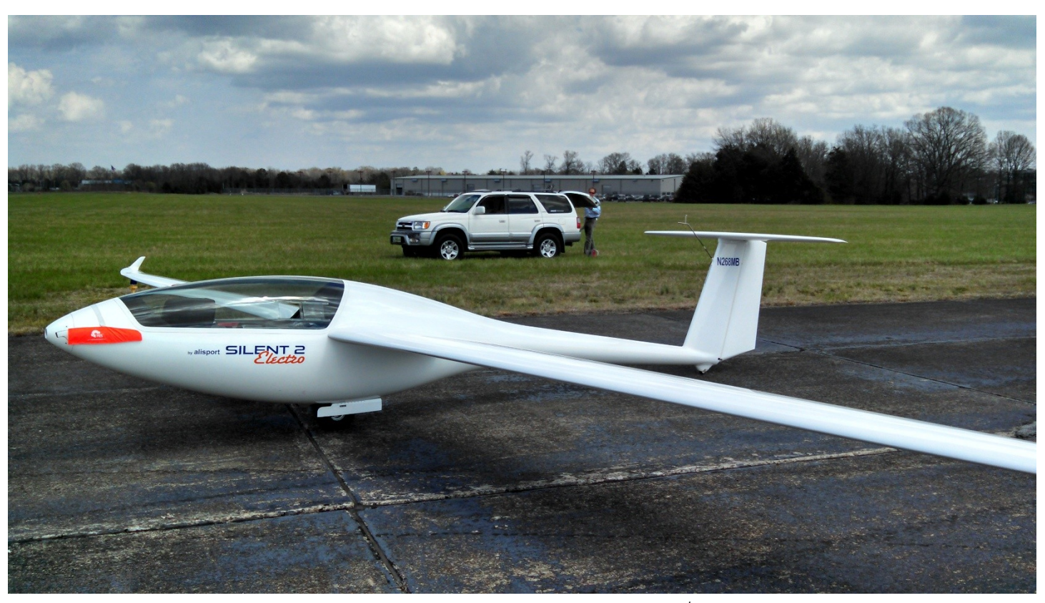
Silent Electro before flying on March 31st