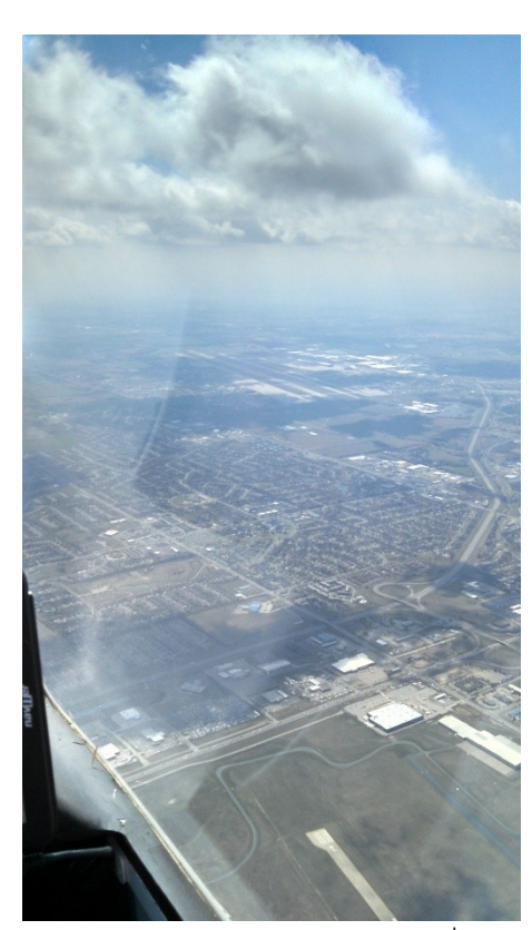
East Wichita on March 22<sup>nd</sup>