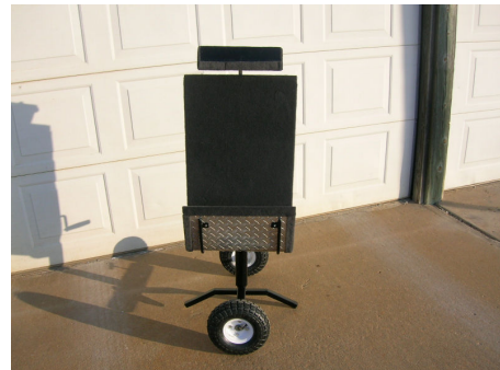
Logback's one man Duster Rigger

I've been working on a one man rigger for the Duster off and on between other projects. Finally have it finished. I'm sure I'll need to do some tweaking after I use it a few times next year but it seemed to work OK when I moved a wing in and out of the trailer. I bought the wheels and the jack from Harbor Freight and had the rest of the stuff laying around the shop