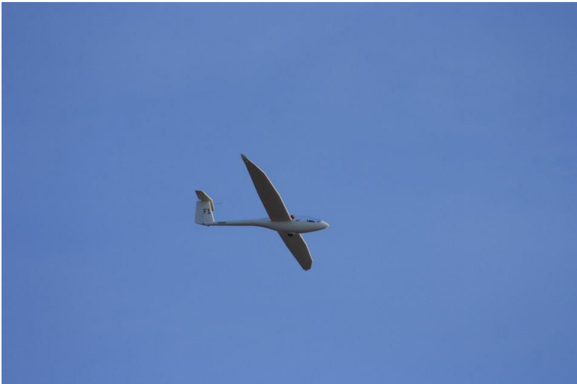
Jeff Beam in F1 soaring on Buffalo Mountain December 1 st