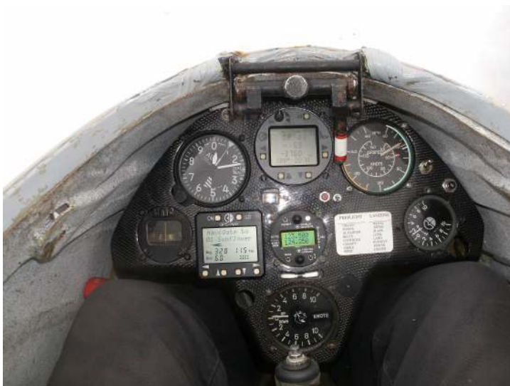
FJ-1 Instrument panel on March 3. Yes, the altimeter reads 10,200 feet.