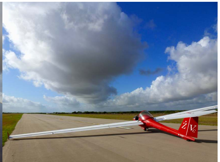
Marsden Gemini at Zapata, TX.