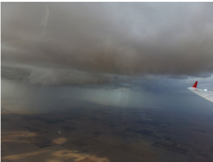
Thunderstorms during flight located north of Lubbock and south of Amarillo