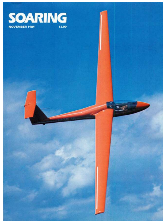
The November 1984 Soaring cover shows why Tony's 1-35 is named "Tangerine"