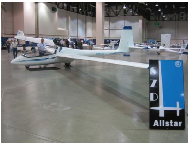
Top: (Left) Dean Gradwell's Ka-6E and (Right) the SZD Perkoz 2 seater.